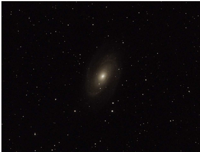
Image taken by Brussels students in Astrolab for the derivation of the Hubble law.